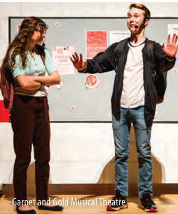
Garnet and Gold Musical Theatre