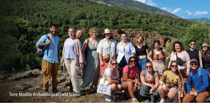
Torre Modillo Archaeological Field School

You can also see the world through Mount Allison a number of other ways, including research opportunities, international internships, conferences, and volunteer efforts.