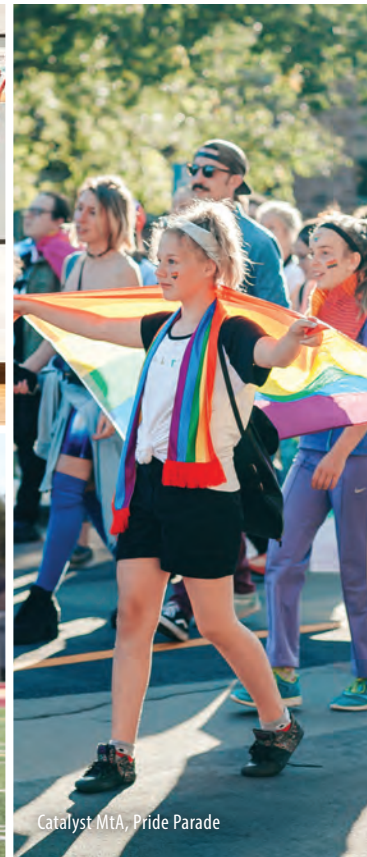
Catalyst MTA, Pride Parade