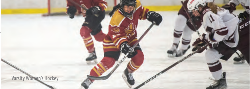
Varsity Women's Hockey

"At Mount Allison, I learned a lot about myself. I embraced my role on the team and learned how to be a good leader. I also learned a lot from many different people, that I now carry with me into my next chapter [in the CFL]."