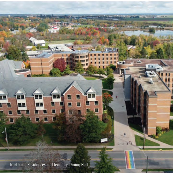
Northside Residences and Jennings Dining Hall