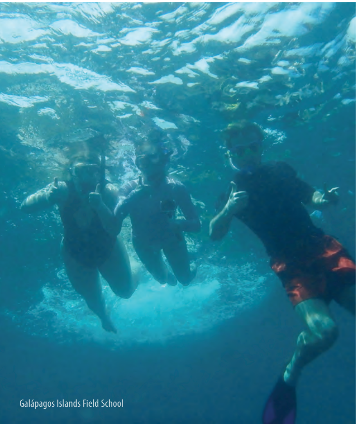
Galápagos Islands Field School