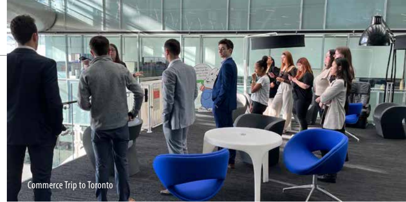
Commerce Trip to Toronto