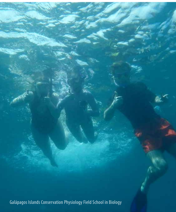
Galápagos Islands Conservation Physiology Field School in Biology