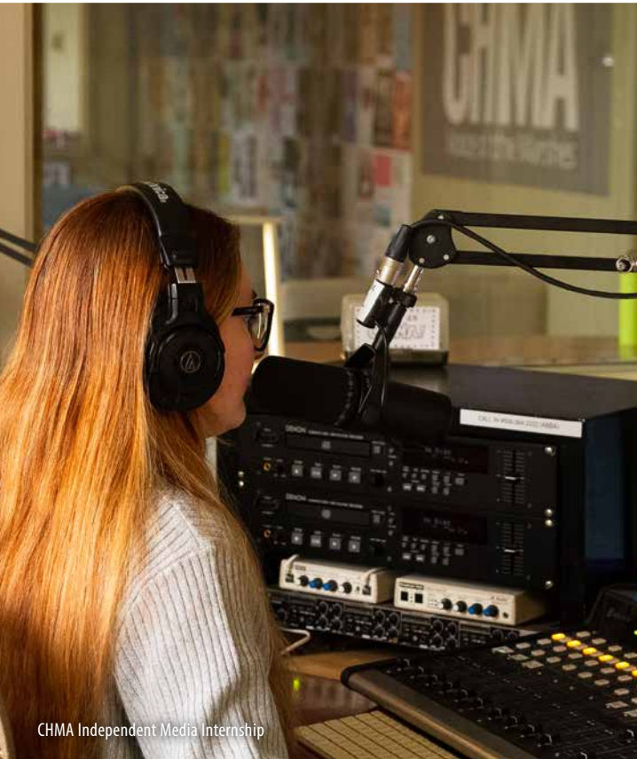
CHMA Independent Media Internship