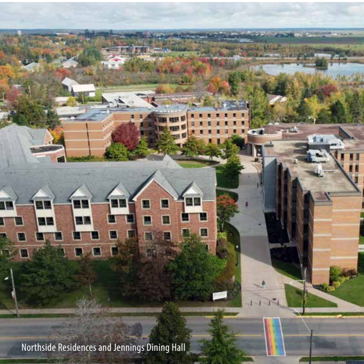
Northside Residences and Jennings Dining Hall