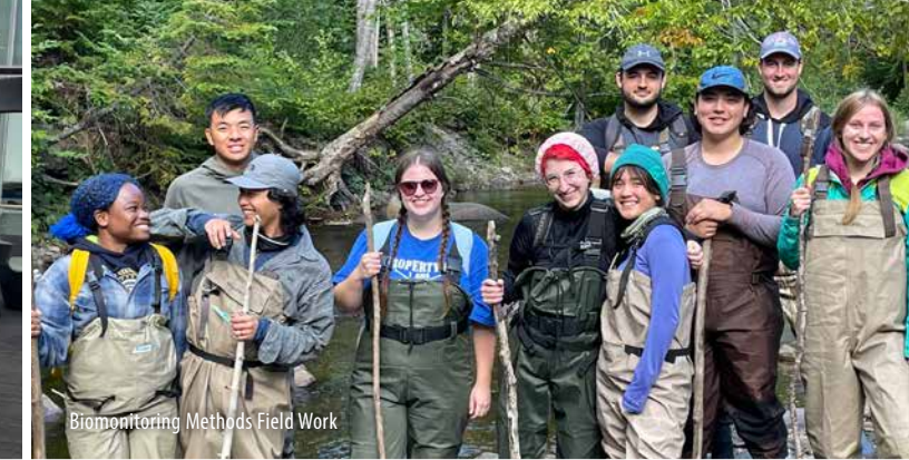
Biomonitoring Methods Field Work